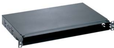
Opticom® Rack Mount Fiber Trays