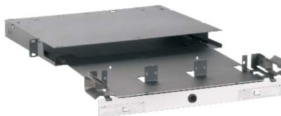
Opticom® Rack Mount Fiber Enclosures